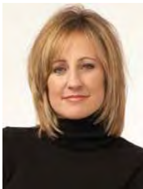
Dee Dee Myers